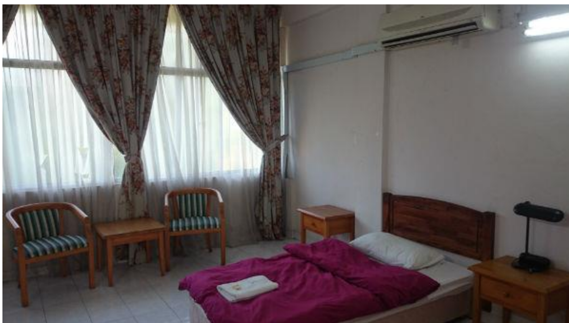
Air-conditioned Twin-Sharing Room