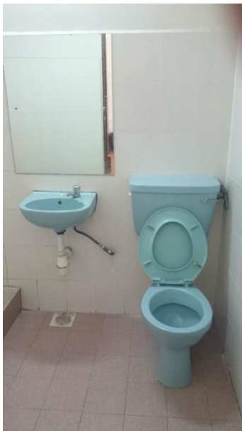
Attached Bathroom with Hot Shower