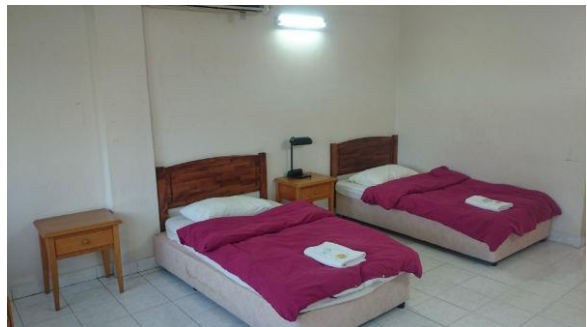
Air-conditioned Twin-sharing Room